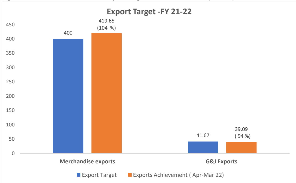
Figure 2 – Merchandise and G&J export targets and achievement (US$ bn)