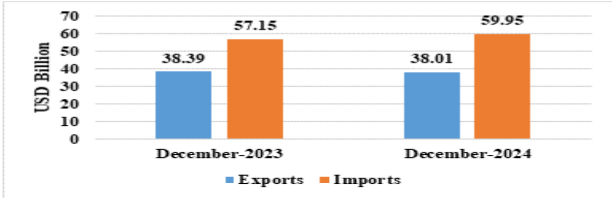
Figure 1 - Merchandise Trade during -December 2024

Source: GJEPC analysis based on DGCI&S data, *The figures for Dec'24 are provisional (Link- Press Release: Press Information Bureau )